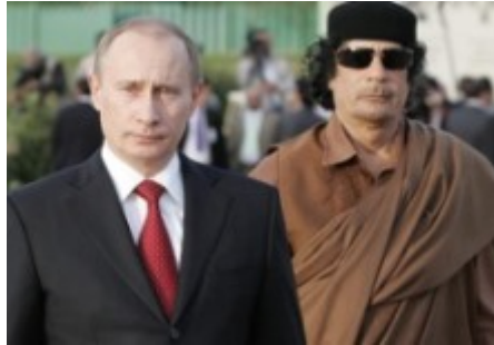
Putin with ABANDONED Gaddafi

Where are the likes of Nikita today? Though the Russian military would intervene for the sake of Russia's survival, as Putin, true to form, would defer to the west and capitulate while squeaking we don't want war -- has it not yet occurred to that cowardly shit that he is dealing with American psychopaths that know only brute force and how to lie through their mass murdering, avaricious teeth. Either step aside for the good of Russia or meet with an unfortunate accident -- your move, chicken shit!