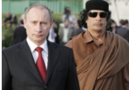
Putin with ABANDONED Gaddafi

Where are the likes of Nikita today? Though the Russian military would intervene for the sake of Russia's survival, as Putin, true to form, would defer to the west and capitulate while squeaking we don't want war -- has it not yet occurred to that cowardly shit that he is dealing with American psychopaths that know only brute force and how to lie through their mass murdering, avaricious teeth. Either step aside for the good of Russia or meet with an unfortunate accident -- your move, chicken shit!