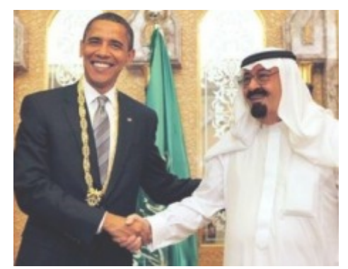
Prince Bandar and Obama

\frac{http://www.zerohedge.com/news/2014-03-12/chairman-joint-chiefs-staff-us-ready-military-response-u}{kraine}