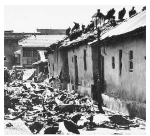
India 1947 - Gandhi's FAILED 'peaceful' revolution -- a feast for vultures

Some of us would remember the big sell of modern appliances and gadgets especially computers a few decades past. They were all sold to society as labor saving and time saving devices, which promised the populations of developed nations more recreational leisure time - what a tragic joke/LIE that turned out to be!