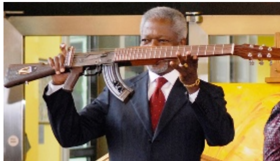
Former UN Secretary, Kofi Annan brandishes an AK-Guitar

Siberian Russian genius, Mikhail Kalashnikov, dies at 94 proving conclusively that it is nous, inventiveness and skill that prevails not money or brute force -- are you reading this America?