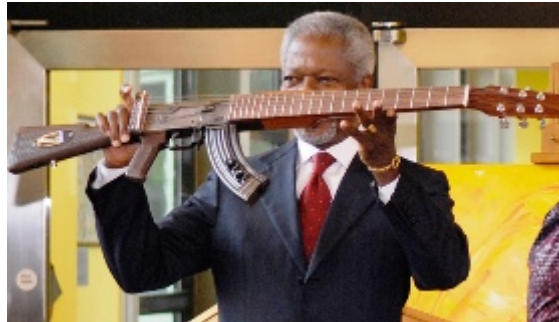
Former UN Secretary, Kofi Annan brandishes an AK-Guitar

Siberian Russian genius, Mikhail Kalashnikov, dies at 94 proving conclusively that it is nous, inventiveness and skill that prevails not money or brute force -- are you reading this America?