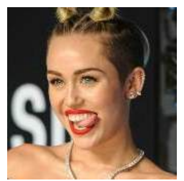
Media fodder, Miley Cyrus

But dare I state the obvious? The only fair and sustainable forms of government are localised cooperatives and mutual aid societies; people take responsibility and work together to ensure the best policy outcomes for the majority. These de-centralised systems are not vulnerable to the corrupting influence of self-interested minority groups. Never forget that good, effective and sustainable government is always LOCAL and participatory -- get involved, democracy is NOT a passive form of government.