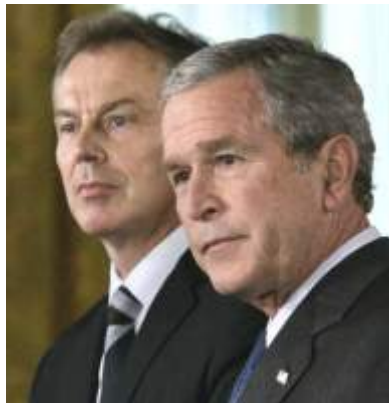
Known war criminals, Bush and Blair

Nobel Peace prize winner and Archbishop of integrity, morality and conscience, Desmond Tutu, has called for the coalition of willing criminal invaders of Iraq, Bush, Blair [and Howard] to stand trial for war and other crimes against humanity.