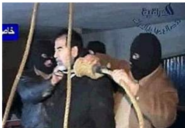
Publicised execution of Saddam Hussein