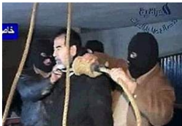
Publicised execution of Saddam Hussein