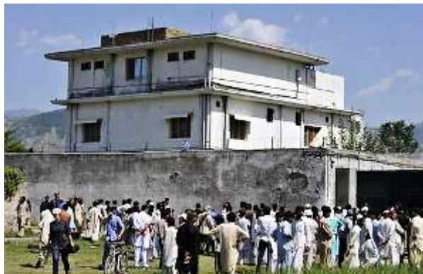
Compound alleged to be the site of Bin Laden's death

I am tempted at times to initiate some form of brain and thinking exercises for the unthinking masses but then I resign myself to reality. Nevertheless, I offer the following as a possible reasoning exercise.