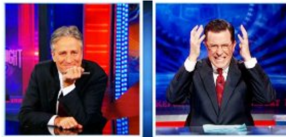
Jon Stewart and Stephen Colbert

Before howls of protest begin allow me to qualify; if political comedy in America is not supported by strong accusation, social agitation and demands for justice then it serves the interests of the powers or ruling plutocracy.