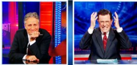
Jon Stewart and Stephen Colbert

Before howls of protest begin allow me to qualify; if political comedy in America is not supported by strong accusation, social agitation and demands for justice then it serves the interests of the powers or ruling plutocracy.