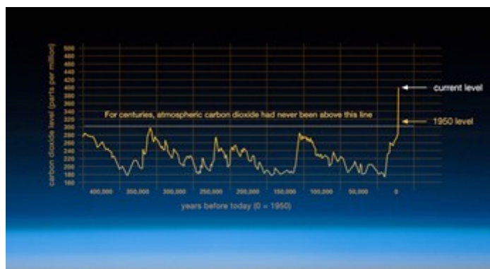
CO2 Increase Graph

As the Trump administration charges forward with its war on science by canceling a " crucial " carbon monitoring system at NASA, scientists and climate experts are sounding alarms over atmospheric concentrations of carbon dioxide (CO2) that just surpassed a "troubling" threshold for the first time in human history.