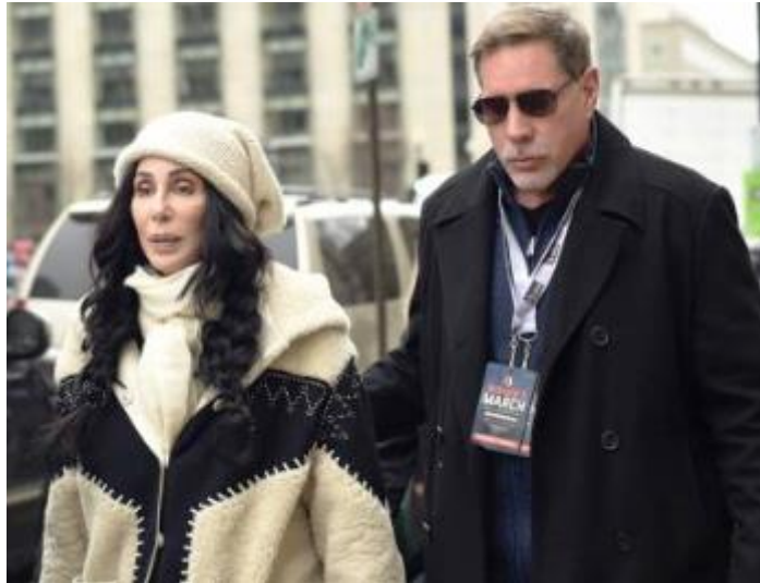
surgically frozen-faced Cher, media diva