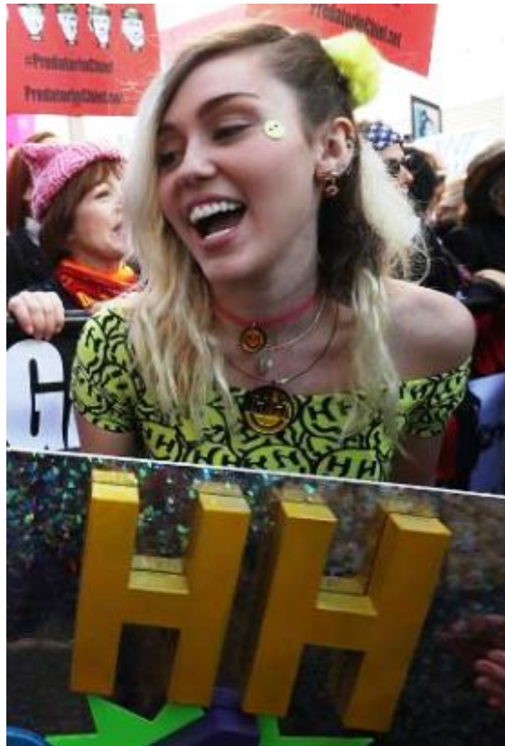
sexploiter, Miley Cyrus, media slave