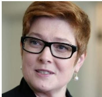
Lackey, un-Australian Defence Minister, Marise Payne

History records that Australian fighting forces under foreign imperial command were often NEEDLESSLY sent to their slaughter and treated as expendable -- those peasant, slave, colonialists! Well, General Blamey changed the status quo on foreign command and attempted to ensure that Oz forces would never again fall victim to such treachery and/or incompetence. Australian troops must be commanded in the field by Australians, it's as simple as that, as too many times since Gallipoli Australians have paid the price for foreign treachery and incompetent command. Yet TODAY we have learned that the current, apron-string, Turnbull government has been blindly led by American forces to commit another war crime in Syria. One which could land Australia in very serious trouble in international courts.