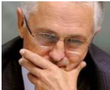
PM, Malcolm Turnbull, 'not worth a pinch of shit!'

http://www.counterpunch.org/2016/09/20/rogue-mission-did-the-pentagon-bomb-syrian-army-to-kill-c easefire-deal/