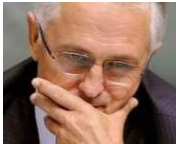
PM, Malcolm Turnbull, 'not worth a pinch of shit!'

http://www.counterpunch.org/2016/09/20/rogue-mission-did-the-pentagon-bomb-syrian-army-to-kill-c-easefire-deal/