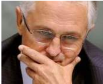
PM, Malcolm Turnbull, 'not worth a pinch of shit!'

http://www.counterpunch.org/2016/09/20/rogue-mission-did-the-pentagon-bomb-syrian-army-to-kill-c easefire-deal/