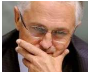
PM, Malcolm Turnbull, 'not worth a pinch of shit!'

http://www.counterpunch.org/2016/09/20/rogue-mission-did-the-pentagon-bomb-syrian-army-to-kill-c-easefire-deal/