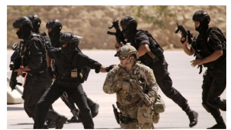
US 'Special Operations' Training Centre in Amman

Since the US armed and trained its initial proxy fighting forces in Afghanistan with the express purpose of combating and defeating its once arch rival the USSR, it has become addicted to utilising the services of fanatic Jihadi fighting groups on the ground that incidentally, have their own agendas -- bear that in mind if you wish to understand the US created fiasco in the Middle East today. The US has utilised the expensive services of murdering fanatics ever since Afghanistan and Libya; it is also well known that Americans have a pathological fear of death and injury but that should never extend to any military as facing death and injury is part of the job description.