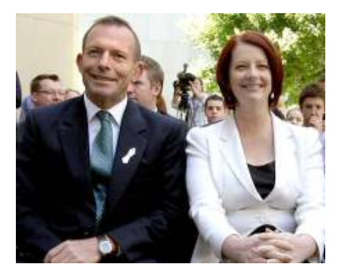
The two worst ...