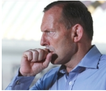
Murdoch's choice, liar and dunce PM, Tony Abbott

My final word is, good luck Washington and of course all the best to geriatric, passed it, Rupert Murdoch, another great choice for puppet PM! And for Aussies that imagine that the Murdoch owned Labor Party is a viable choice , just keep reading Murdoch's newspapers for all your 'news.'