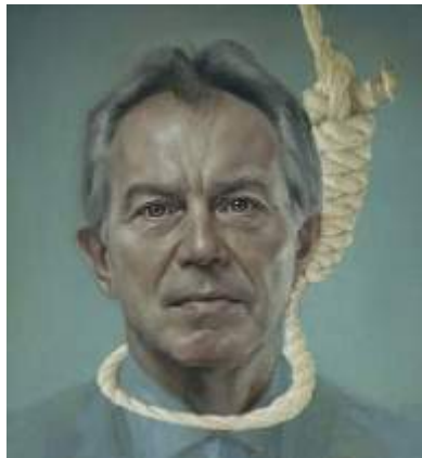
War criminal Tony Blair

The editorial team wishes to apologise to our readers for not covering the award given to Tony Blair, by 'Save the Children.' We have received no posts on this outrageous event. However, the reaction of our editorial team is beyond shock and reason, not only does it stagger the moral fibre of being in the overwhelming majority of sane people on this planet but it also staggers the imagination to the point of muteness -- we understand.