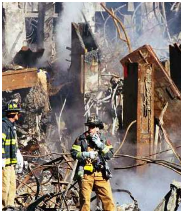
Ground Zero -- have a good look!

of losing their reputations; well, good luck to the spineless narcissists. The people have no such concerns, they overwhelmingly dis-count the US government fiction and omission story.