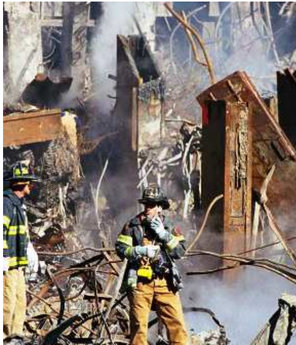
Ground Zero -- have a good look!

of losing their reputations; well, good luck to the spineless narcissists. The people have no such concerns, they overwhelmingly dis-count the US government fiction and omission story.