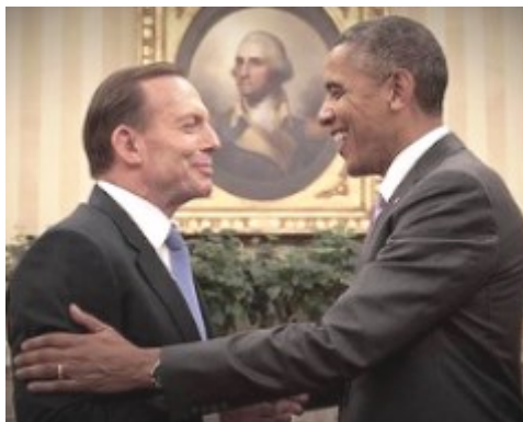
Abbott ready to give poof Obama a polish

http://landdestroyer.blogspot.com.au/2014/07/flight-mh17-down-over-ukraine.html