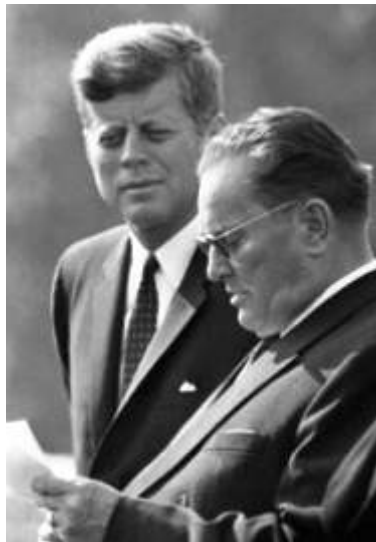
JFK with Tito

It is to be expected that the mass media and alternative media should, without exception, focus on the gambit between Russia and the US/NATO, when in actual REALITY a number of smaller States and non-State players stand to make enormous gains from this superpower confrontation. We refer to the genius politics of Marshal Tito, probably the leading exponent of small State effective geo-politics, the world has ever seen.