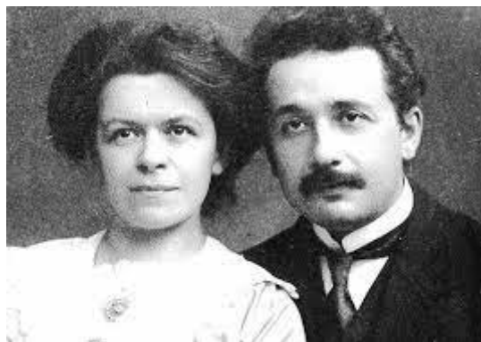
Visionary physicist Maric with Husband Einstein