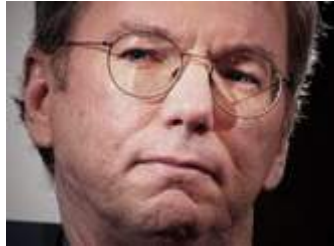
Google chairman, Eric Schmidt

The Australian Taxation Office (ATO) is a bureaucracy and the Oz government is owned by plutocrats and their multinational interests -- so what is wrong with the headline?