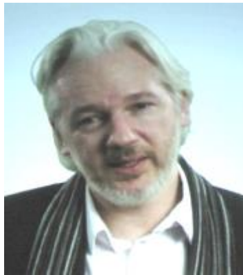
Assange, the worse for 'indoor' wear

This year Assange spoke from his self-imposed prison at the Ecuadorian Embassy in London -- Assange has now painfully learnt the COST of breaking the cardinal rule of uber hackers, ANONYMITY! However, Assange's discourse at the SXSW was interrupted by numerous technical breaks -- which is ironic if you consider the gathering is organised and run by digital 'geeks' -- try learning how to maintain communications by using multiple synchronised lines of various media interchanging between them if bogeys attempt to disrupt events -- the modern audience, God help the useless lamers, has no staying power whatsoever, which again verifies that social change is ALWAYS the RESULT of actions and strategies of a very few highly motivated and skilled individuals; in that context Assange's address simply became another exercise in narcissism. No sympathy or apologies, mate, as you set an appalling example for younger, emerging digital warriors!